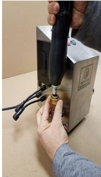
Attach Hose to Pump