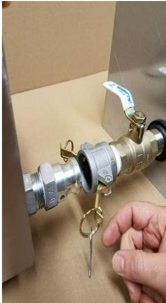
Attach Pump to Valve