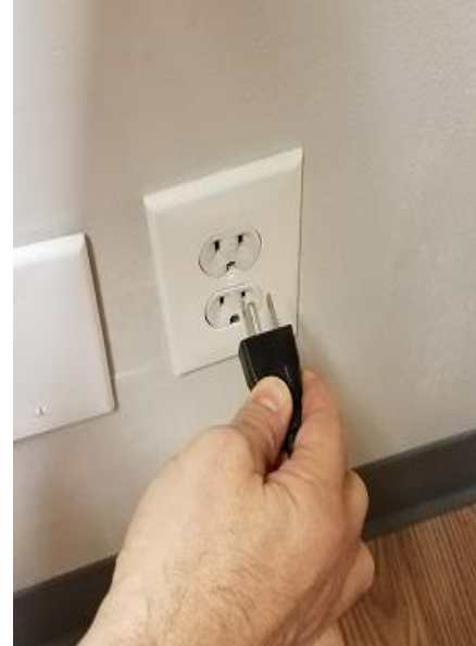
Plug System In

6. FOR SYSTEMS WITH BOOMS, SWIVEL ARMS, HOSE BALANCER & HOSE HAMMOCK ONLY: