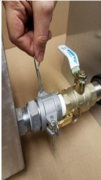
Insert "Locking" PIN