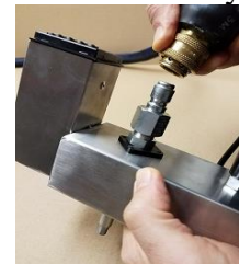
Attach Dispensing Head to Hose