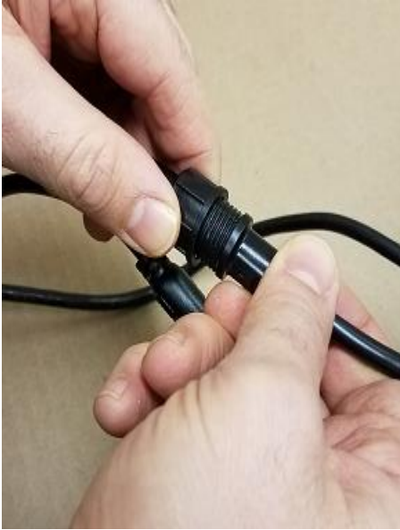
Connect 5-Pin electrical connection between Pump and Hose

5. Plug in pump, connect electrical connections between pump & hose, hose & dispensing gun as follows: