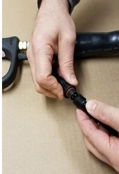
Connect 3-Pin electrical connection between Hose and Dispensing Gun