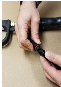
Connect 3-Pin electrical connection between Hose and Dispensing Gun