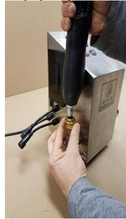
Hose to Control Box/Pump