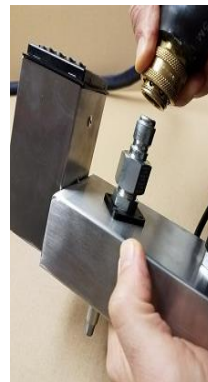
Hose to Head

6. Connect the pin connectors from the Hose to the Control Box & from hose to Autoshot Head. Make sure pins line up with sockets.