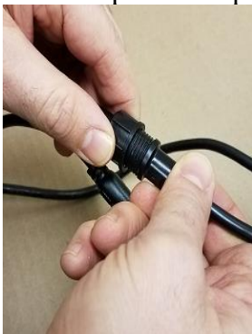
Connect 5-Pin electrical connection between Pump and Hose

6. Connect the pin connectors from the Hose to the Control Box & from hose to Autoshot Head. Make sure pins line up with sockets.