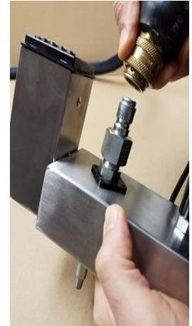
Hose to Head