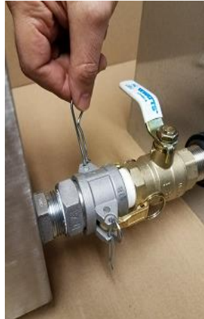
Insert "Locking" PIN