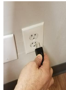
Plug System In