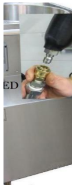
Hose to CART